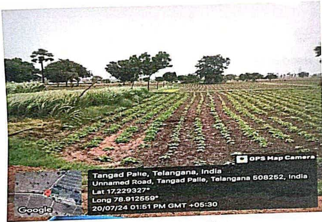
Agricultural fields of the Petitioner